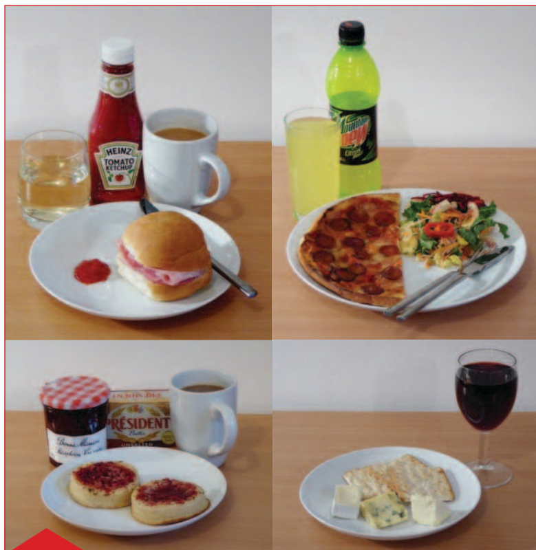
■ Figure 2. Four meals and snacks with similar salt and water content: a bacon roll with ketchup, apple juice and a mug of tea with milk (3.2 g salt, 400 ml water); pepperoni pizza with side salad and a large glass of soft drink (2 g salt, 250 ml water); buttered crumpet with jam and a white coffee (1.8 g salt, 225 ml water); cheese with crackers and a glass of wine (1.4 g salt, 17 ml water)

A daily intake of six grams of salt, as recommended by the UK Food Standards Agency, should result in an IDFG that most dialysis patients can tolerate. Many foods now have labels to show how much salt (or sodium) they contain, either in grams or as a percentage of this allowance. Your dietitian will be able to advise you on foods to limit or avoid, and how to read the labels.