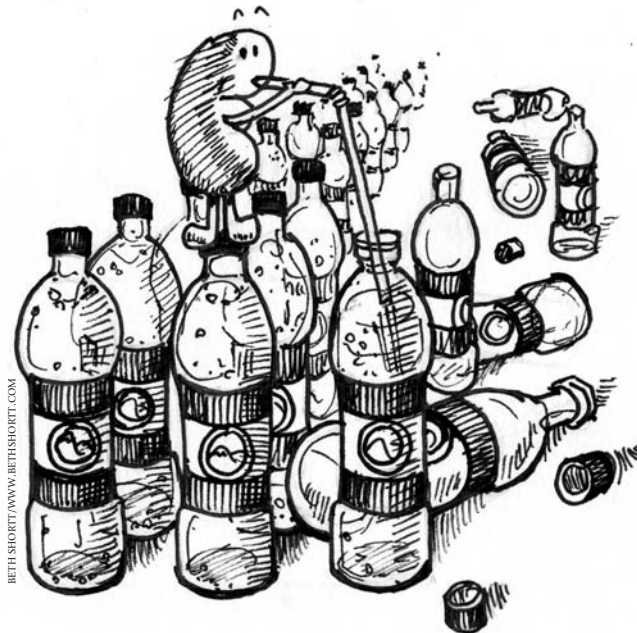
Figure 4. Normal kidneys filter over 100 ml/min (over 150 litres) of blood per day. This is processed in the renal tubules so that only about one hundredth of that amount (one to two litres) reaches the urine

There are two other major ways. In one, a tiny amount of a radioactive substance is injected and its rate of travel through the kidney is measured. In the other, simple blood tests (including creatinine) are used, along with age, sex and