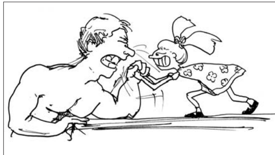
Figure 1. This body-builder has normal kidneys and a creatinine level of 120 \mu\text{mol/l} . The little girl has normal kidneys and a creatinine level of less than 60 \mu\text{mol/l} .

These are the best routine blood tests for measuring how well your kidneys are working. Creatinine is produced by muscles and excreted by the kidneys. Because it is produced by muscles,