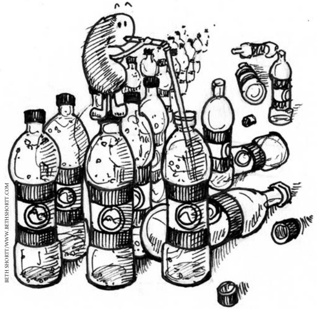
Figure 4. Normal kidneys filter over 100 ml/min (over 150 litres) of blood per day. This is processed in the renal tubules so that only about one hundredth of that amount (one to two litres) reaches the urine

There are two other major ways. In one, a tiny amount of a radioactive substance is injected and its rate of travel through the kidney is measured. In the other, simple blood tests (including creatinine) are used, along with age, sex and