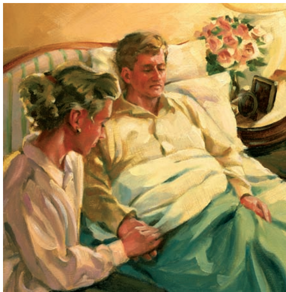
Family members may find caring for their loved one at home a daunting prospect, but help and support are available

if you become unwell for other reasons. For example, diarrhoea or vomiting, which you might normally have treated yourself, may need more specialist help if you have established renal failure.